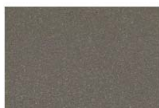
Grigio Marmo Antico